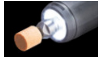
3 LEDs Enhances visibility in tight spaces