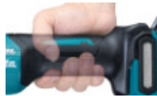
Slim grip 146 mm circumference