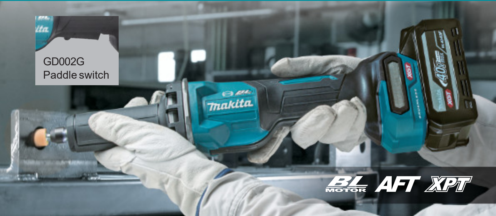
GD002G Paddle switch