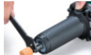
Shaft lock The spindle can be locked with the button for accessory removal/installation.