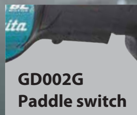
GD002G Paddle switch