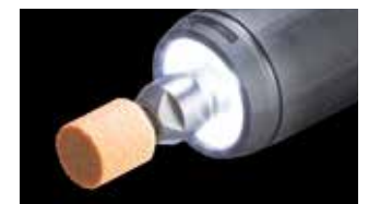
3 LEDs Enhances visibility in tight spaces