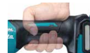
Slim grip 146 mm circumference