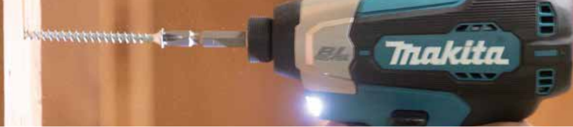
Bit is option