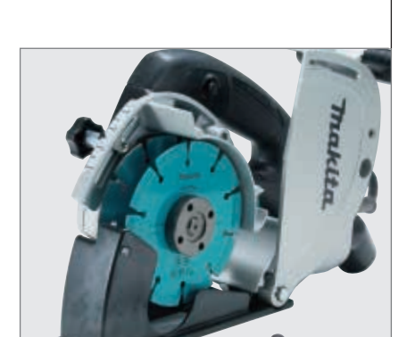
Aluminum blade case designed to allow for easy blade replacement