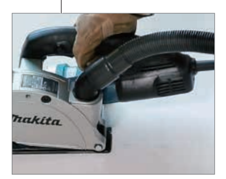
Connectable to vacuum cleaners for clean work environment