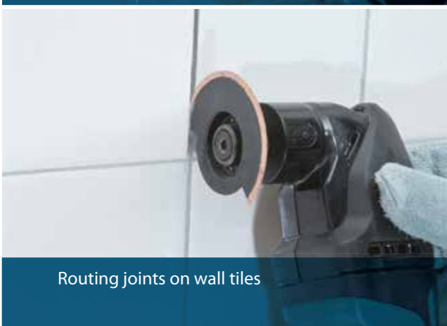
Routing joints on wall tiles