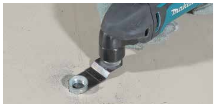
Metal flush cutting