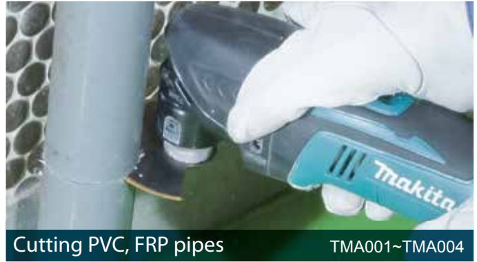
Cutting PVC, FRP pipes