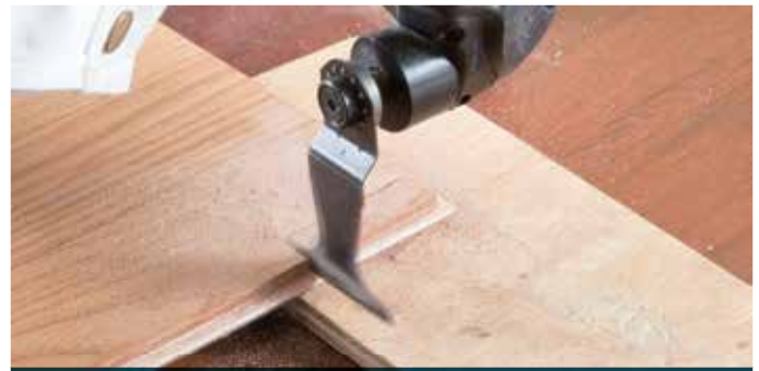
Wood plunge cutting