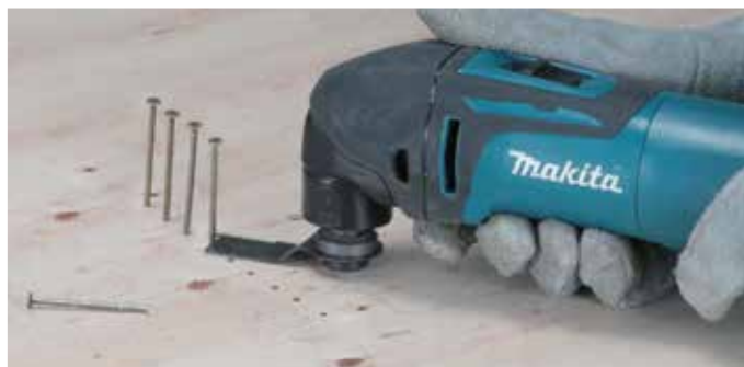
Flush cutting of nails