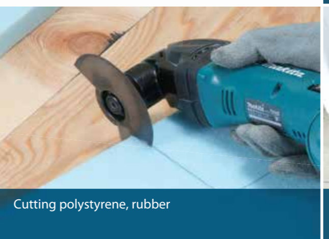
Cutting polystyrene, rubber