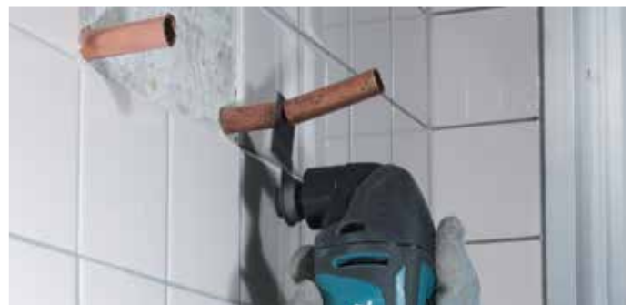
Cutting copper pipe