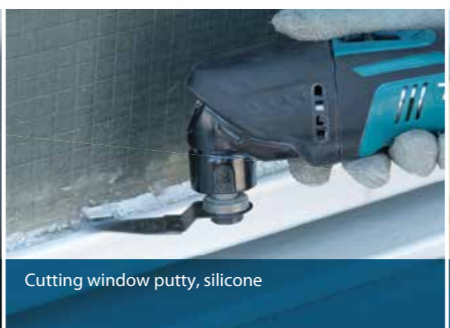
Cutting window putty, silicone