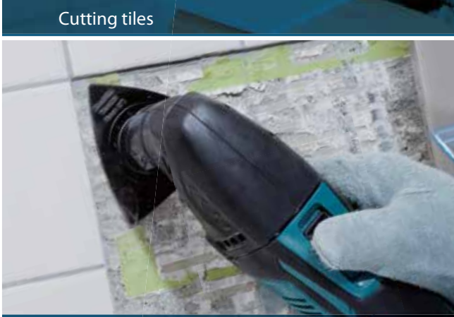
Removing mortar, tile adhesive