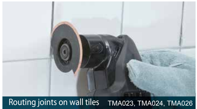
Routing joints on wall tiles