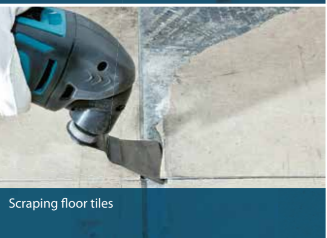
Scraping floor tiles