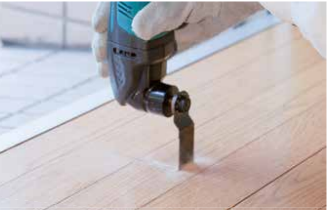
Deep plunge cutting