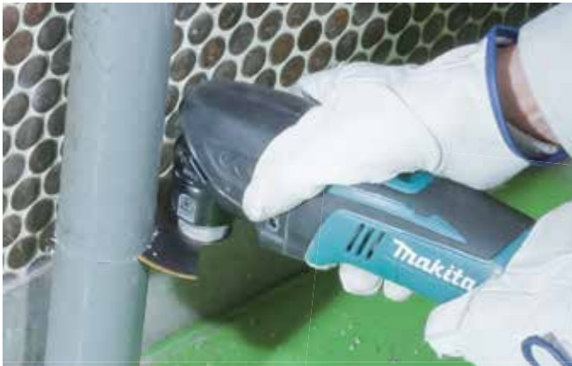
Cutting PVC, FRP pipes