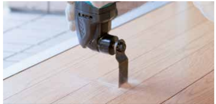
Deep plunge cutting