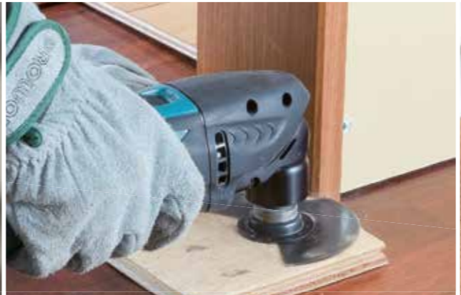
Wood flush cutting