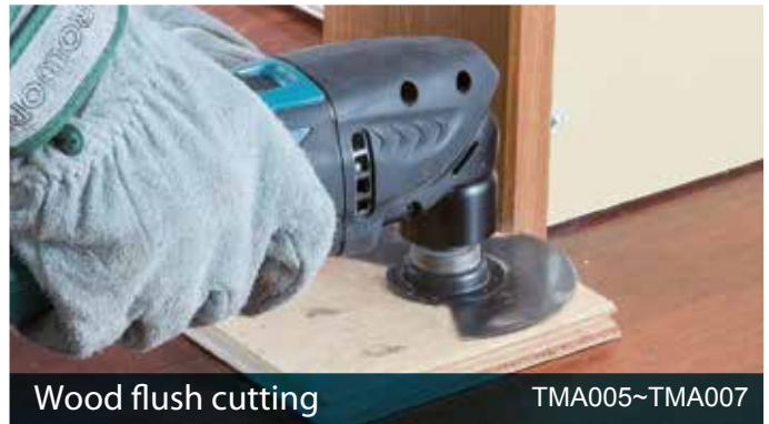
Wood flush cutting