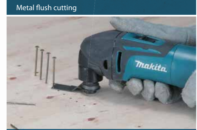
Flush cutting of nails