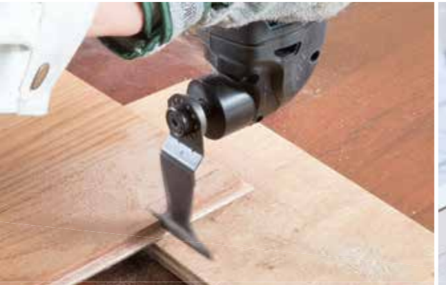
Wood plunge cutting