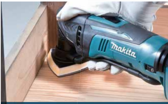
Sanding and polishing various materials