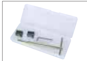
Detachable tool-box for standard equipment