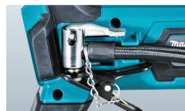
Hose can be stored