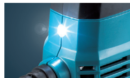
LED job Light for easy operation at dark places.