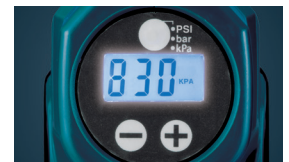
Digital pressure gauge provides high visibility with backlight.