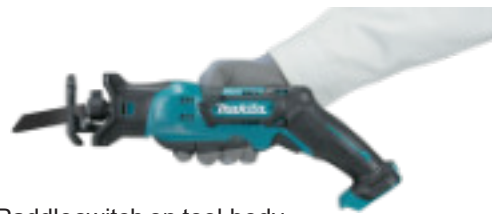
Paddleswitch on tool body