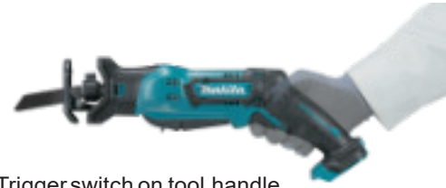
Trigger switch on tool handle