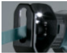
LED job light