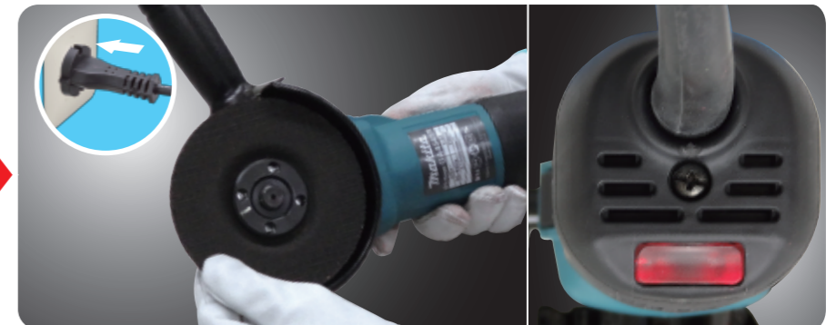
Even if plugged in with the switch "ON", the tool does not start with a blinking red light for visual warning.