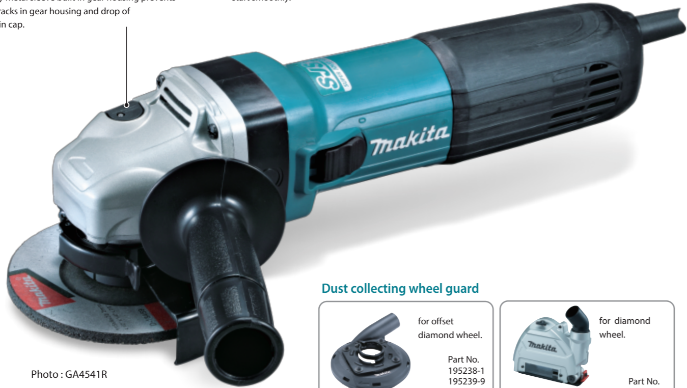
Photo : GA4541R

Soft Start Minimizes start-up shock, and makes the tool start smoothly.