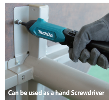
Can be used as a hand Screwdriver