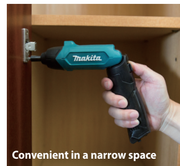
Convenient in a narrow space