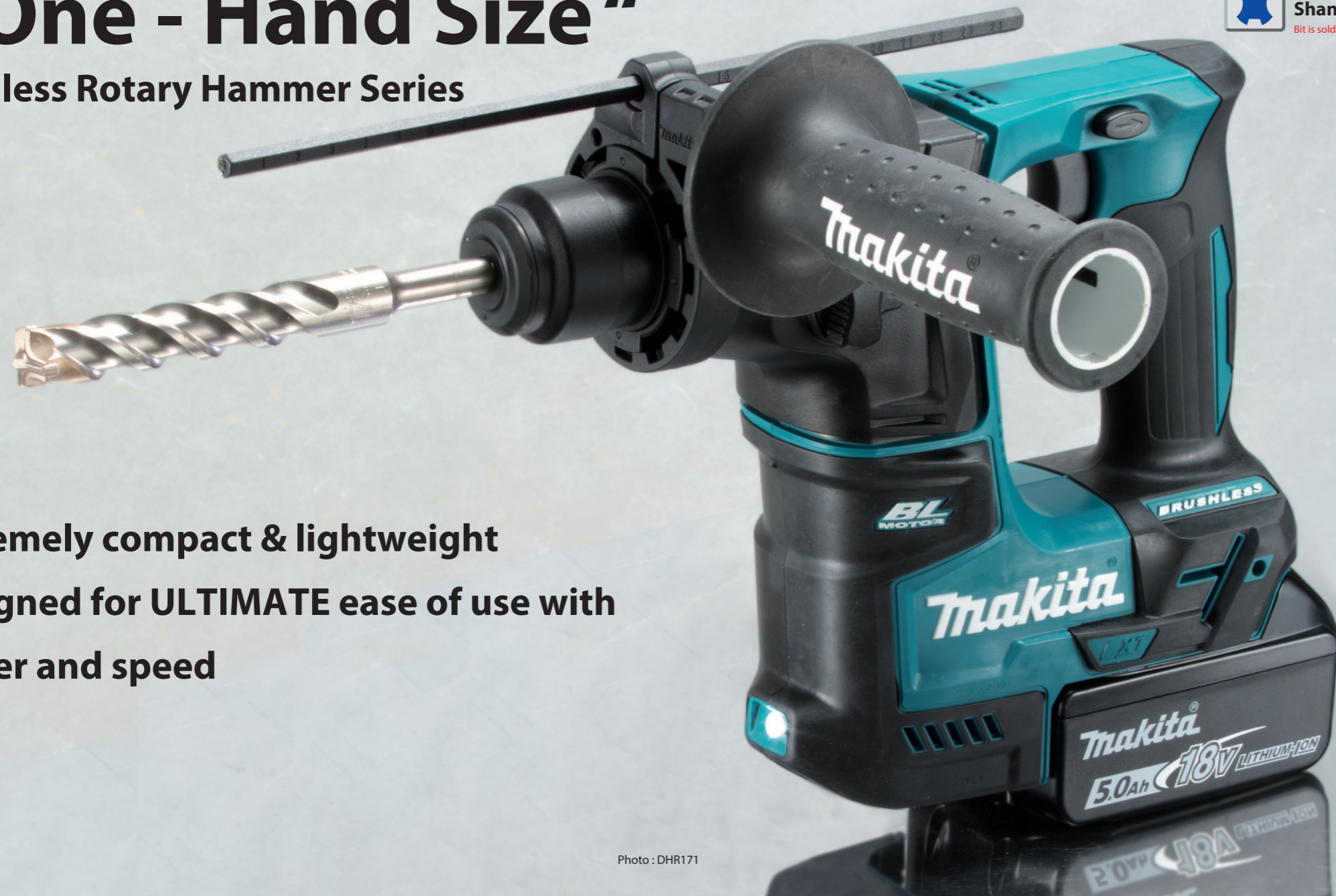
Photo : DHR171

SDS-PLUS bit Shank Bit is sold separately.