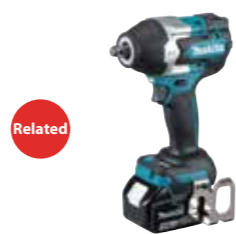
DTW700 Brushless Cordless Impact Wrench 18V LXT BL 1/2" (12.7 mm) 700 N-m (520 ft.lbs.)