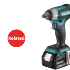
DTW181 Brushless Cordless Impact Wrench 18V LXT BL 1/2" (12.7 mm) 210 N-m (155 ft.lbs.)

The extended handle allows a user to tighten nuts without constantly bending over, reducing fatigue especially for tasks like railway maintenance.