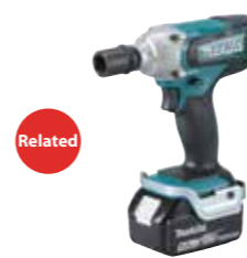
DTW190 Cordless Impact Wrench 18V LXT Li-Ion 1/2" (12.7 mm) 190 N-m (140 ft.lbs.)