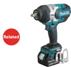
DTW1002 Brushless Cordless Impact Wrench 18V LXT BL 3-Speed 1/2" (12.7 mm) 1,200 N-m (890 ft.lbs.)