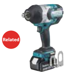
DTW1001 Brushless Cordless Impact Wrench 18V LXT BL 3-Speed 3/4" (19 mm) 1,250 N-m (920 ft.lbs.)

Stronger Business, Smarter Tools – Thanks to Makita