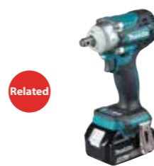
DTW300 Brushless Cordless Impact Wrench 18V LXT BL 1/2" (12.7 mm) 330 N-m (240 ft.lbs.)